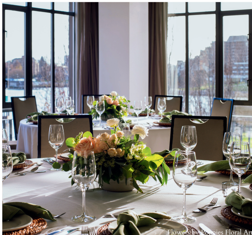
Flowers by Poppies Floral Art

The Micro Wedding Package is for those who are seeking a more intimate yet unforgettable experience. Our outdoor 6th Floor Patio and our Pacific Suite offer the best backdrops for your intimate ceremony and reception. This patio provides the wow factor that you are looking for in your micro ceremony venue, while the Pacific Suite matches it's grandeur with floor-to-ceiling windows and a bright and sophisticated finish.