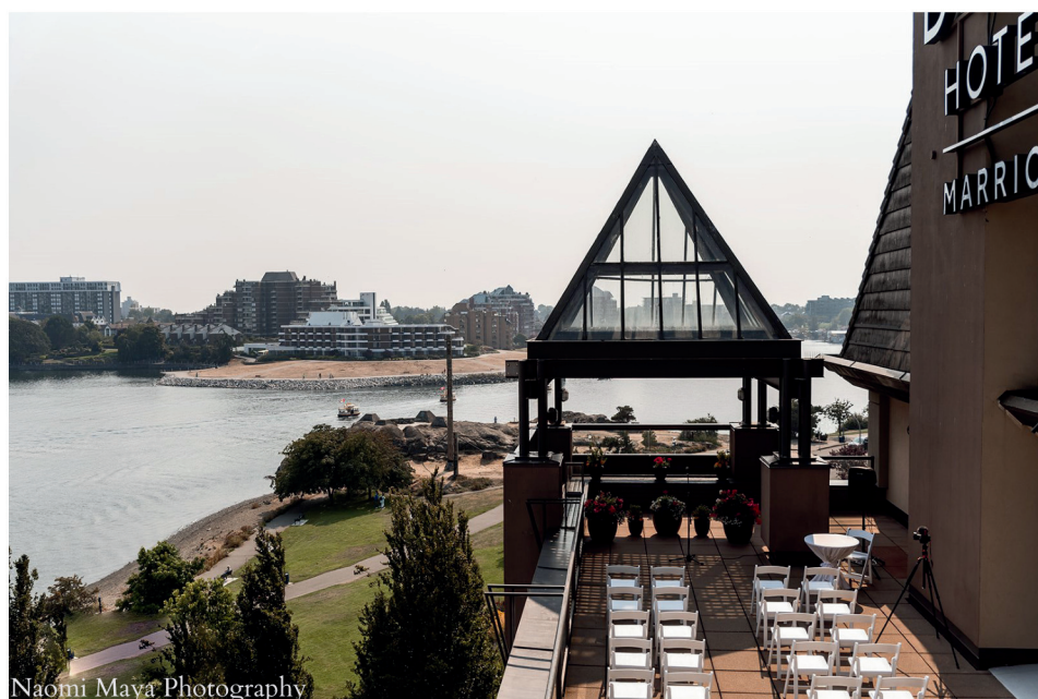
Naomi Maya Photography